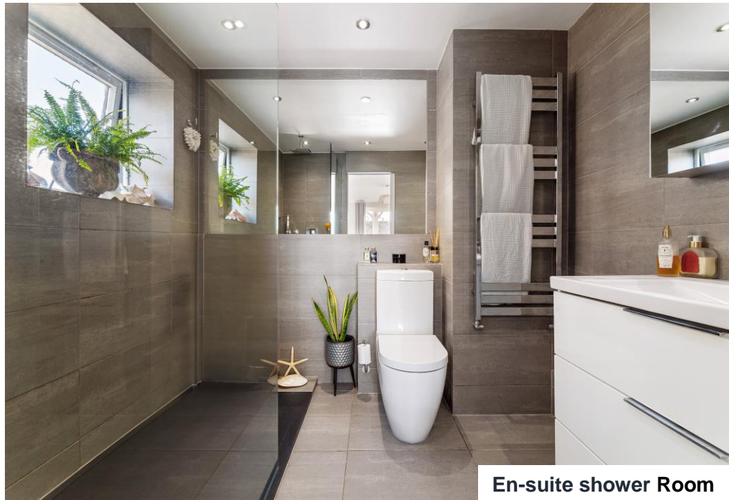
En-suite shower Room